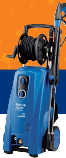
XT model with hose reel